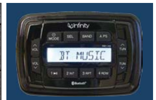
Infinity™ Audio System