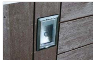
Bluetooth Docking Station

(STB) Bluetooth Audio with Dock (STI2) Infinity™ AM/FM / Bluetooth Audio Circulation Pump LED Jets White Palm Features Includes filter well LED lights