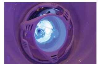
Illuminated Jets / White Palm